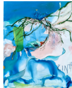
Alberto Ballocca, King Cinto, 2026, Natural pigment, airbrush, acrylic, mural paint, oil pastel on canvas, 55 x 43.3in (140 x 110 cm)