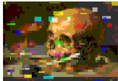
Paul Choate, Reinterpretation of Pieter Claesz Vanitas, 2026 Acrylic on wood panel, 18 x 24 in