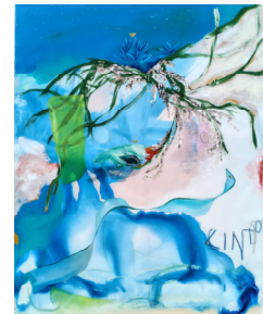
Alberto Ballocca, King Cinto, 2026, Natural pigment, airbrush, acrylic, mural paint, oil pastel on canvas, 55 x 43.3in (140 x 110 cm)